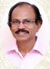
Sri. M.R Balachandran Nair Hon'ble District Judge (Rtd)